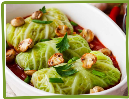
stuffed cabbage rolls