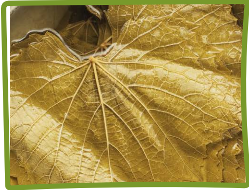
vine leaves in brine