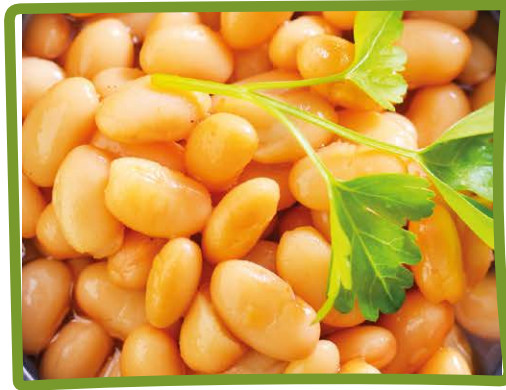
cooked white beans