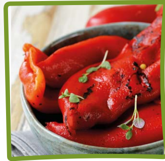
roasted capia pepper