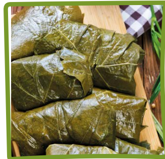
stuffed vine leaves