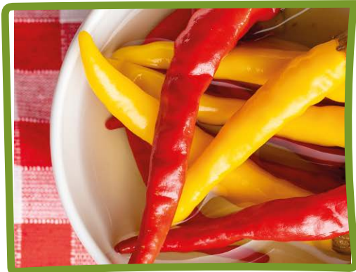
pepper pickle varieties