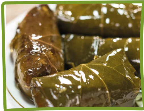
stuffed vine leaves