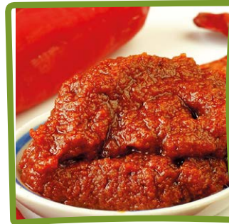
sweet red pepper paste